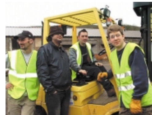
New Kerbside employees.

Thank You for supporting your Kerbside Recycling Service