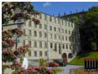
Central Park, Spring Edge, Misc

Thank you to everyone at Calrec Audio in Hebden Bridge who have helped us in many ways including putting this newsletter together.